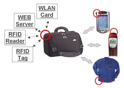
Figure 2. Context aware suitcase

As one example application, we mention a context-aware luggage [7] shown in Figure 2 .